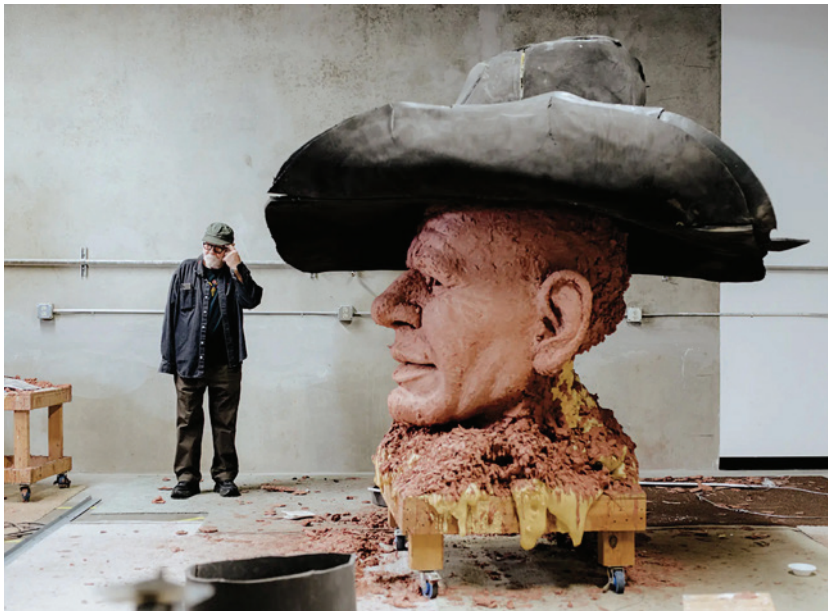
Paul McCarthy with in-progress clay bust of actor Charles Bronson. 2021 •